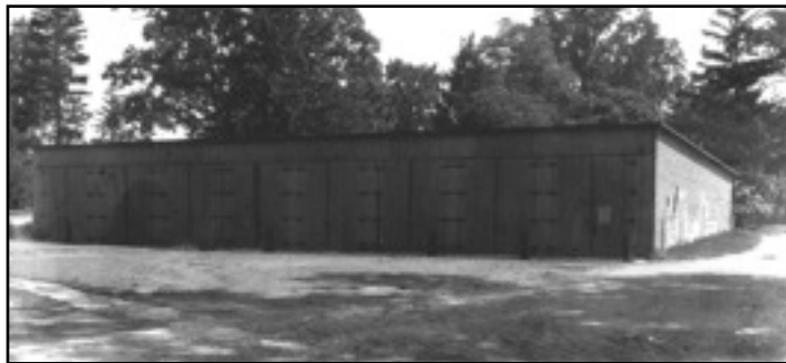
Figure 8: Artillery shed that was built in the spot of old College Hall after it collapsed (Photo courtesy of MSU Archives and Historical Collections).

The timeline for the deposition of the College Hall bricks, therefore, is complicated by the construction of the bridge. Two possibilities exist. The first is that these bricks were deposited in 1918 to serve as drainage for the flooding, and in preparation for a bridge to be built at a