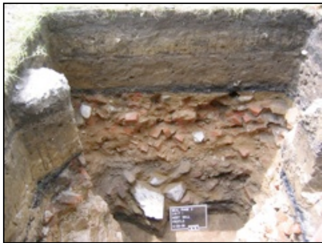
Figure 5: West Wall of Unit 1, at 2.28 meters in depth.

This unit provided the most information, as it indicated heavy filling along the slope from the intersection of West Circle Drive and Kalamazoo Street towards the River. As previously mentioned, the historical documentation indicates that this area was a deep depression, while the ground for the road and bridge was raised by fill from the excavations of People's Church. The fill discovered in Unit 1 show that this depression was filled with bricks.