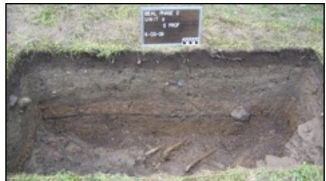
Figure 7: South Wall Profile of Unit 2. Above the dark ash layer, a distinct clay layer represents a flood layer.

This unit included 7 layers, and was located to the Southwest of Unit 1, further down the slope towards the river. In this Unit, disarticulated bricks appeared in the west corner. These bricks were primarily yellow brick, and were associated with tile from the “AE Tile Co.”. This company dates between 1876 and 1935. The next level, at 53 cm deep, was of sterile yellow clay (10YR 4/4). It is likely that this 13 cm level was a deposit of alluvial flooding, as indicated in the material