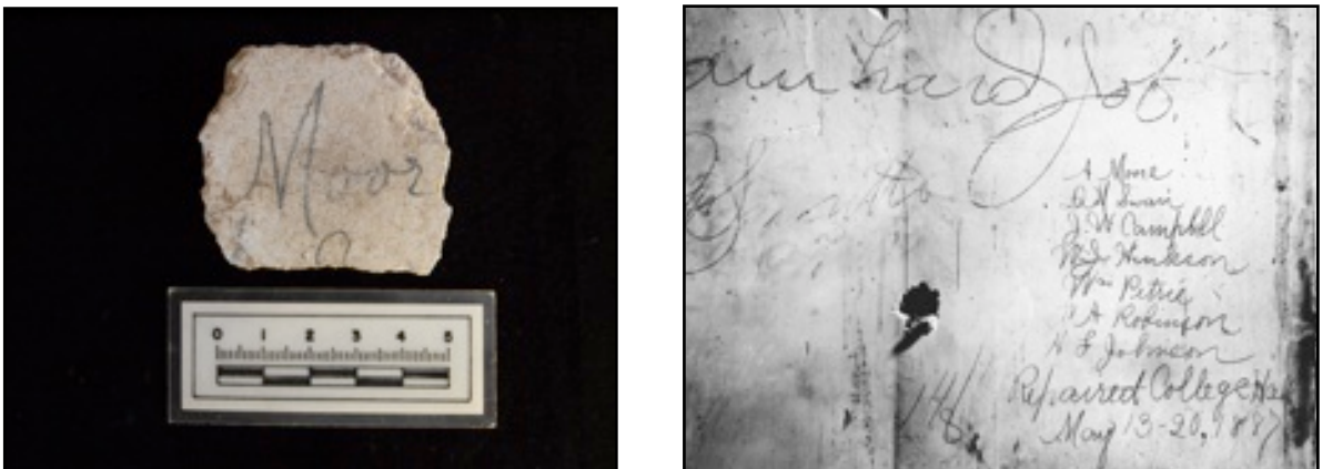
Figure 6: This piece of plaster (on left) had the writing “Moor” on it, which matched perfectly with graffiti discovered in the basement of College Hall in 1918 (on right). It was written in May of 1887, as indicated on the graffiti.

While backfilling Unit 1, a piece of plaster was discovered that had writing on it. It is likely that this piece was from the Eastern half of the unit, since we did not screen. The letters on the piece were “Moor”. It was not until October 2009 that it was discovered through archival research for a project at the site of College Hall, MSU’s first building built in 1855, where the artifact was originally from (Lewandowski 2010). In 1887, MAC students spent part of their May break repairing College Hall. These students wrote graffiti on one of the basement walls. The first student to do so was named Alexander Moore. A photograph of the graffiti was taken by the people who tore down College Hall in 1918 (Figure 6). This artifact, therefore, provides a direct link between College Hall and this brick rubble, suggesting that these bricks were the remains of MSU’s first academic building.