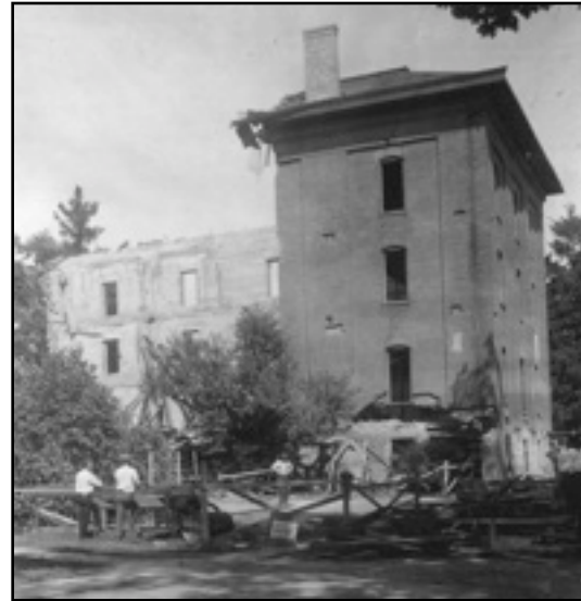
Figure 9: College Hall after part of it collapsed, August 1918 (Photo courtesy of MSU Archives and Historical Collections).

Regardless, the function of these bricks does not change; they would have served as a makeshift drainage system, keeping the river from eroding the newly formed, and very steep, banks created by the newly built road and bridge. This site, therefore, is representative of the extensive modification that happened throughout the campus to combat the disruptive effects caused by the environment. As the campus expanded, the river became a central part of the landscape. This made land modification to control the floods essential for the campus to function efficiently. In this case, that was done in order to provide better access to the athletic fields and the expanding college south of the river. This site, therefore, fits nicely into the model of campus development within the third phase.