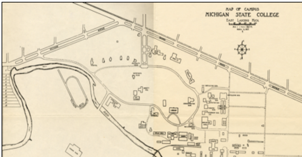
Figure 3: Campus map from 1927 showing the addition of the athletic fields on South Campus, the removal of the River Road and the realignment of West Circle Drive to its current position (Courtesy of MSU Archives and Historical Collections).

buildings were built to the northeast of the investigation area: a classroom building called College Hall, a dormitory called Saints' Rest, and four farmhouses for the faculty. After the passage of the Morrill Land Grant Act in 1862, MAC was able to expand. A large building campaign took place, adding additional classrooms and laboratories along the Eastern part of