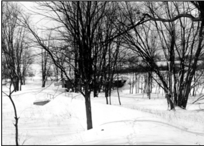
Figure 4: The old bridge leading to the athletic fields. Bleachers can be seen across the river on the right, through the trees. The footpath, indicated by the footprints in the snow, mark the River Road.

campus, expanding the row of faculty homes, and adding industrial and facility structures to the South, along Red Cedar River (Widder 2005; Kuhn 1955). By the turn of the century, enrollment doubled; the campus expanded further east, and also moved their athletic facilities south of the Red Cedar River. The faculty began to move off campus into East Lansing, the new town that had formed around the College. Some old faculty homes became educational buildings, acting as dorms and practice houses, while others were destroyed. During the 1920s, a dramatic shift in architecture began to take place. Large structures, such as the Home Economics Building, the Student Union, and the New