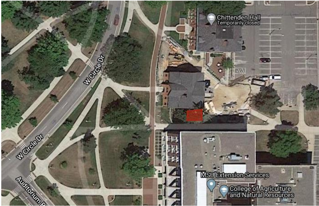
Figure 1: Map of Cook Hall, red box indicates area of impact and the general location of the cistern.